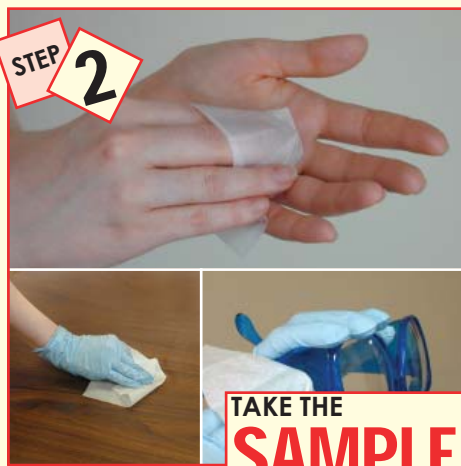
STEP 2 TAKE THE SAMPLE