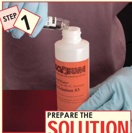
STEP 1 PREPARE THE SOLUTION